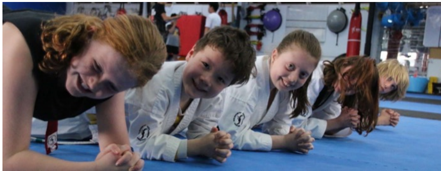
The Vikings showing off their Planking skills during the Strength event.