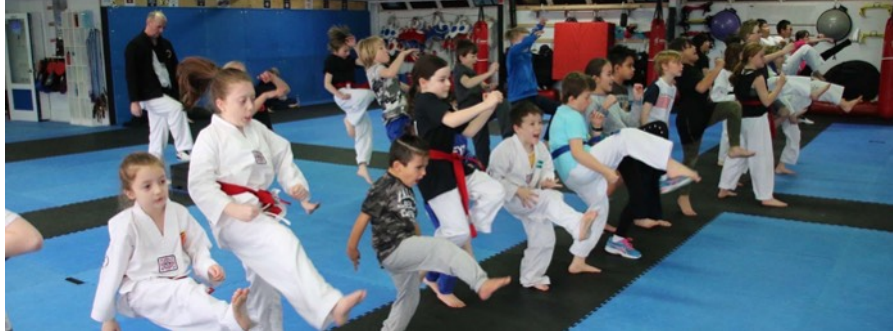
The Jumping Front Kick Competition Warm-up.